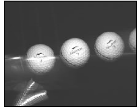
Golf Ball Dynamics: 5 \mu s exposure, 750 \mu s delay and 8 ms duration xenon flash